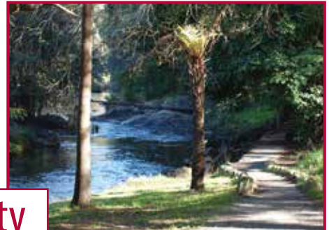
Riverwalks on the Yarra