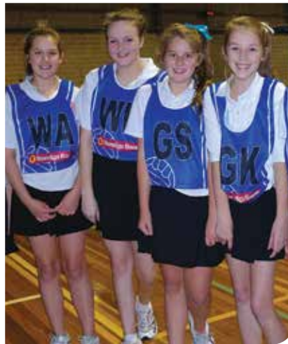
Junior netball team members

The Warburton Junior Netball Club has provided hundreds of children with the opportunity to develop their netball skills and self-worth by playing, growing and having fun in a team. Their recent sponsorship of $2030 will be used to make sure the netball club remains accessible and affordable for all families. Essential equipment such as netballs, whistles and first aid kits will be purchased and training for their volunteer coaches with Netball Victoria can now be arranged. But perhaps the most enjoyable and anticipated benefit from the sponsorship is an upcoming club excursion when team members will attend a Melbourne Vixens game. This may be the only opportunity some of the children have to experience a sporting event of this calibre. Have a great time, kids!