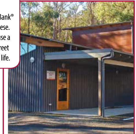
UYCH Workskills centre