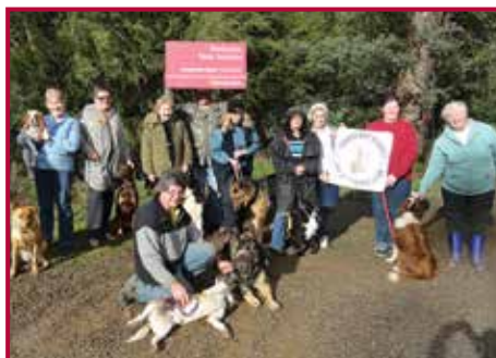
Wesburn Dog Obedience Club