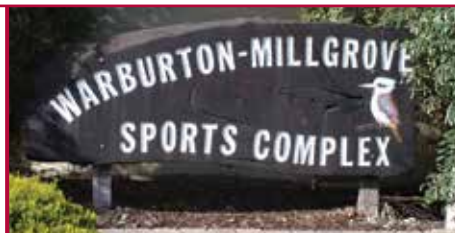
Warburton -Millgrove sports precinct