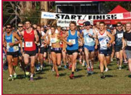
Up and Running annual event