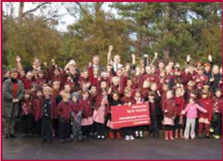
Wesburn Primary School