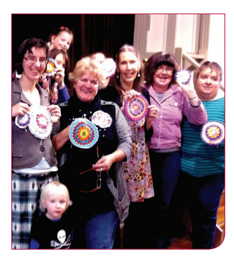
Craft queens of the valley