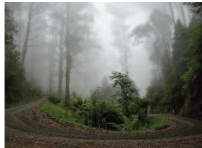
Around We Go - Heather Walker