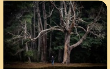
Graeme Edwards – 'Into the Dark Woods'