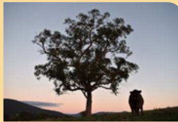
U18 Judges' Choice - Lara Bennett for 'Big Things, Little Things'