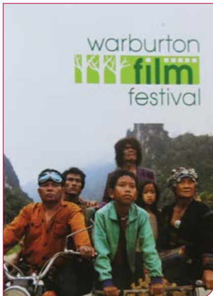
A feast of films to enjoy