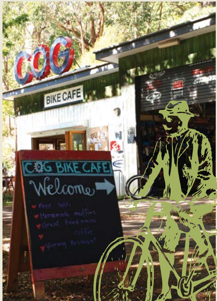
COG Bike café in Warburton was recently voted No 2 of the top 50 cycling cafes in Australia

Over the years, our sponsorship has been fundamental to preparing the way for this cycling boon and we are pleased to share in the vision for our Rail Trail. As an historical lifeline to the town, the Rail Trail is much loved – cycling can bring renewed vigour and enlivenment to our region, and will enhance our reputation as a healthy and beautiful, nature-oriented region that lives and loves the Australian outdoors. For more information visit Friends of Lilydale to Warburton Rail Trail on Facebook.